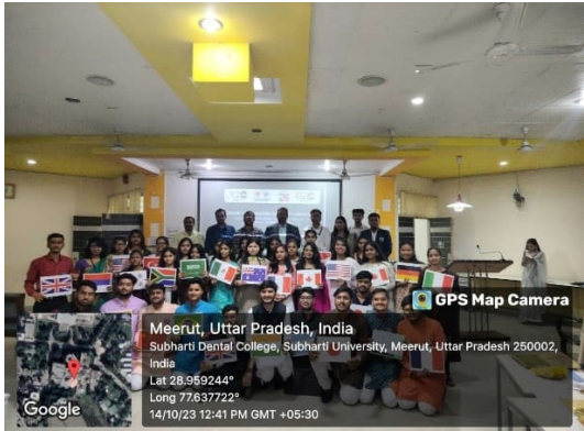
Meerut, Uttar Pradesh, India Subharti Dental College, Subharti University, Meerut, Uttar Pradesh 250002, India Lat 28.959244° Long 77.637722° 14/10/23 12:41 PM GMT +05:30