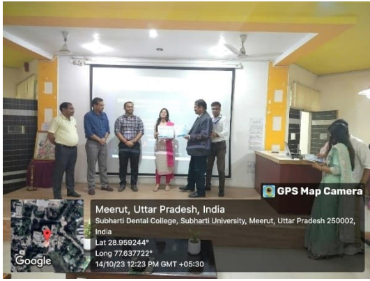
Meerut, Uttar Pradesh, India Subharti Dental College, Subharti University, Meerut, Uttar Pradesh 250002, India Lat 28.959244° Long 77.637722° 14/10/23 12:23 PM GMT +05:30