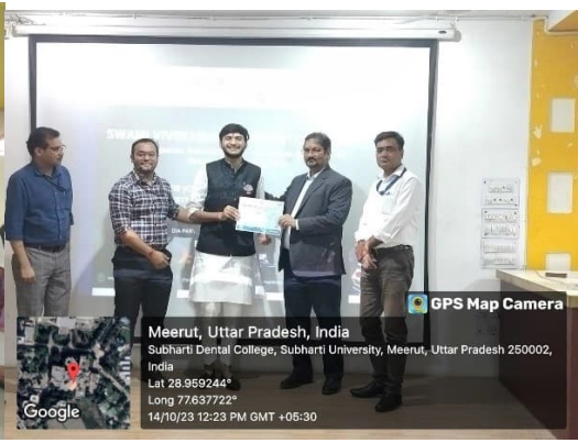
Meerut, Uttar Pradesh, India Subharti Dental College, Subharti University, Meerut, Uttar Pradesh 250002, India Lat 28.959244° Long 77.637722° 14/10/23 12:23 PM GMT +05:30